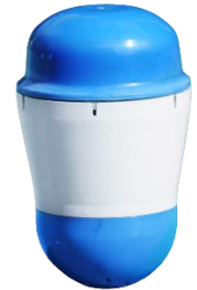
Buoys for free floating in pool